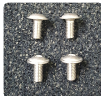
Set for sunroof (optional)