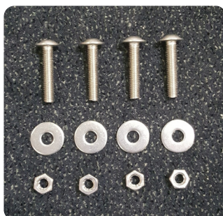
Set for Rotaid Cabinet