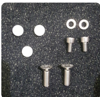
Set for footplate