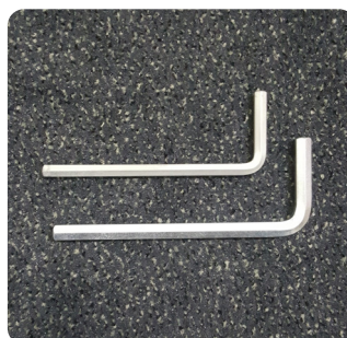
2x Allen key (4 en 5 mm)